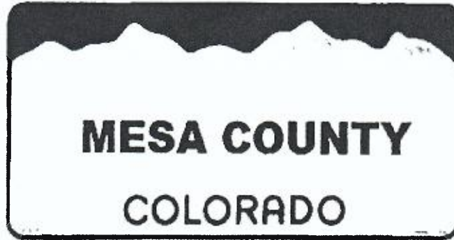
PLATE MAILING NEW RESIDENT COVER SHEET AND CHECKLIST

THIS SHEET MUST BE ON TOP OF THE SUBMITTED DOCUMENTS TO ENSURE EXPEDIENT PROCESSING!